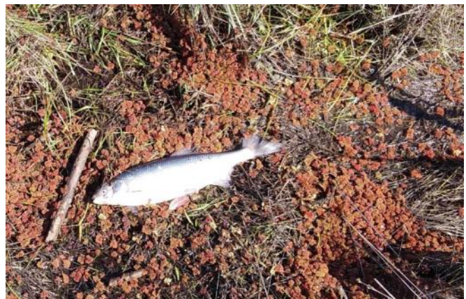
A surprising find was 19 dead Hitch that came on to the property because of the high lake level.

On that sunny March day tiny, red Azolla ferns covered the ground. These are floating plants, and their presence showed the water line from the preceding days. We saw the first partially consumed fish and wondered if a clever raccoon had been able to grab it and dropped it. Then we noticed more fish, and eventually counted 19 stranded hitch, some partly consumed, and some apparently whole and untouched.