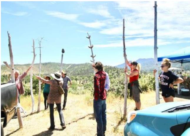
The group discusses placement of the display.