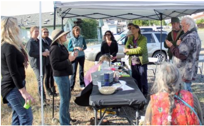
Folks gathered under the easy up on a cool Friday night to celebrate the opening of a unique art installation on Rabbit Hill, a Lake County Land Trust property in Middletown.