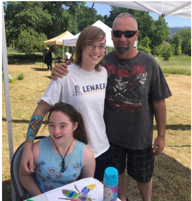
A “nature art,” table was a fun feature and enjoyed by kids and families alike.