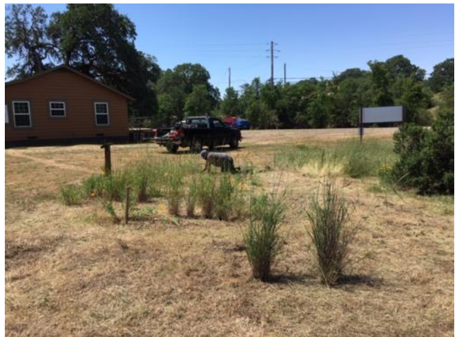
The Elymus Glaucus (Blue Wild Rye) patch in the yard at Rodman Preserve.