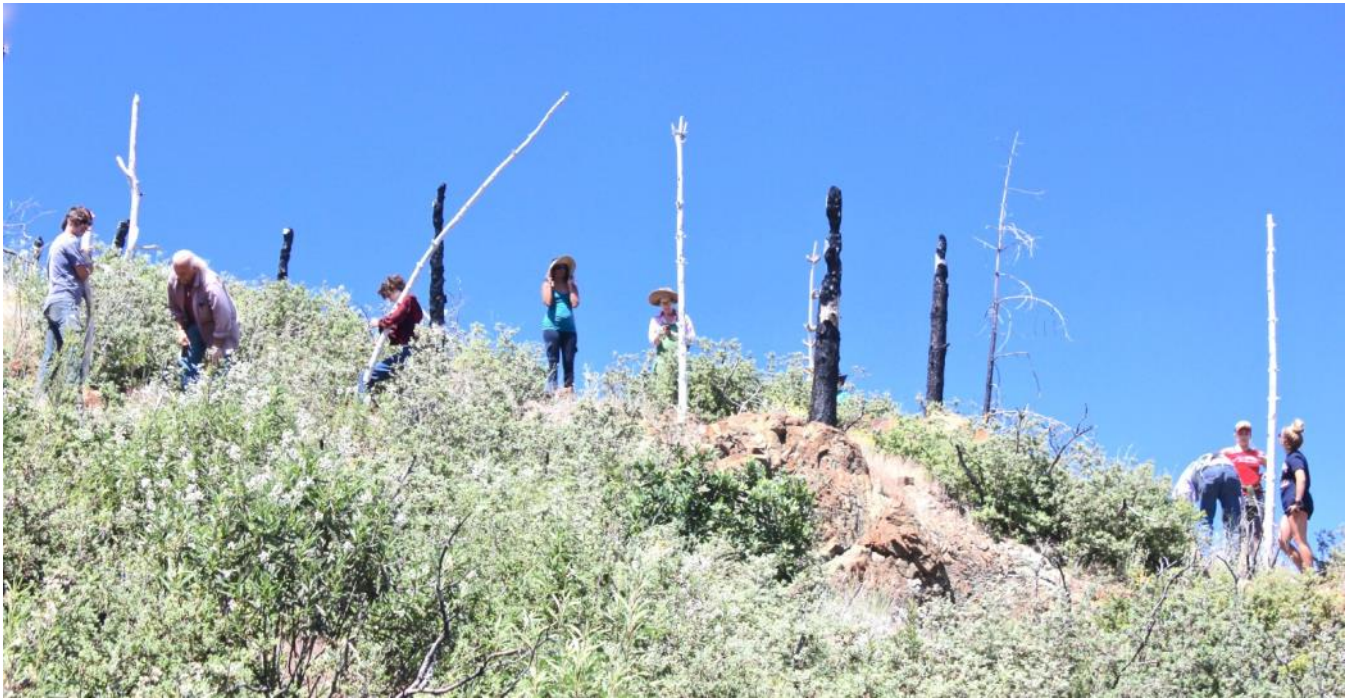
Community members and professional artists work together to set up the art trail on Rabbit Hill.