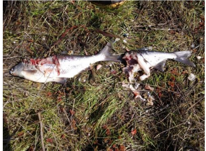
Hitch are part of the food web; looks like something enjoyed a fishy snack; maybe a raccoon?