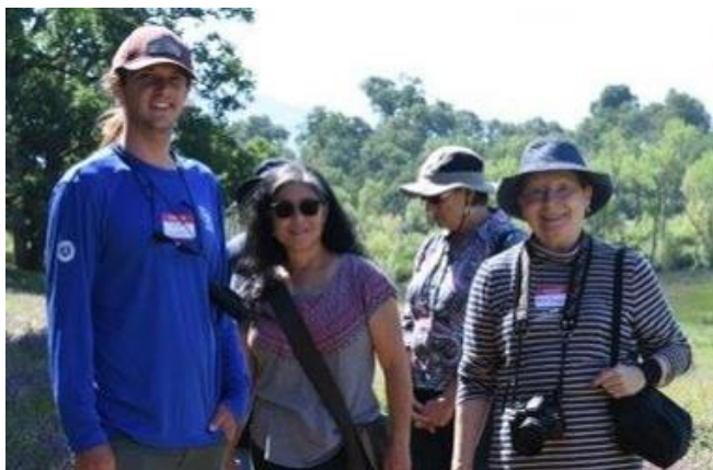
On the trail during the photography walk at the Rodman Preserve during the Art and Nature Day held on May 5.