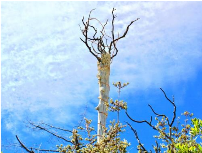
One of the sculptures erected on Rabbit Hill.