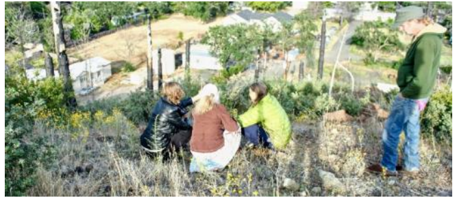
A group of artists and friends check out the art installation on Rabbit Hill.