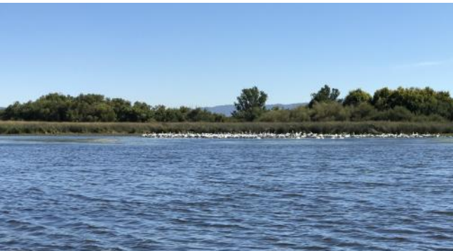
White Pelicans are often found along the shoreline of the Wright property, part of the Lake County Land Trust’s Big Valley Wetlands protection plan.