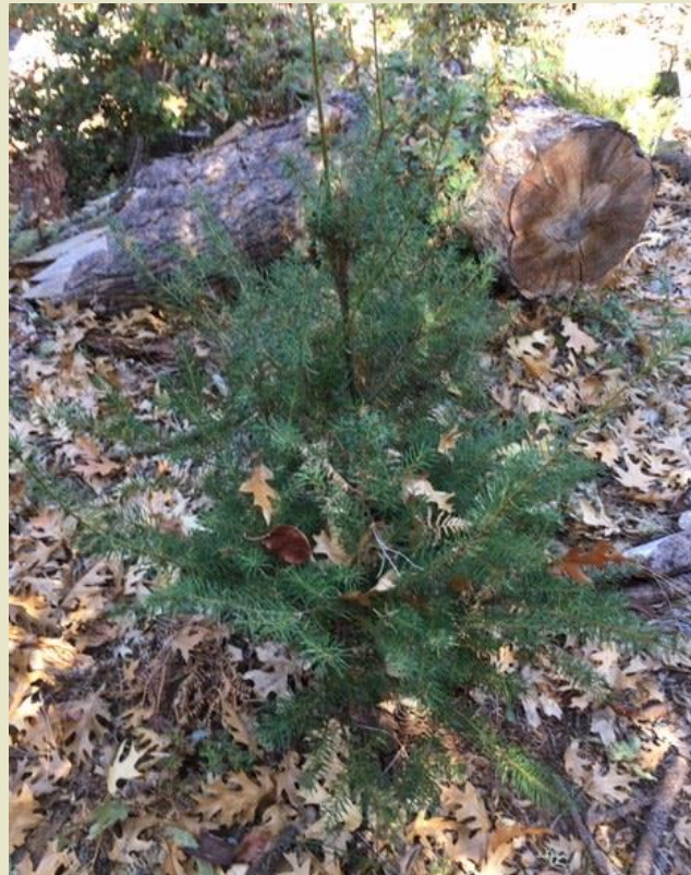
This small Douglas Fir tree will eventually take the place of one that has died.

When we first noticed the increased conifer death several years ago, we were saddened and struggled to understand if there was something we could or should do. We chose to be patient and observe for a while how the forest community responds. With a closer look, it was obvious that we need not despair. Nature is cycling through its stages of death and re-growth, and the opening and closing of opportunities with change. More sunshine coming through the tall trees is fueling the growth of the young ones; the understory native grasses, scrub oak, madrone, and manzanita are also faring well. We agreed that the dead-fall in the understory needs some management (which we will be discussing with TNC), and as we discussed plans for rescheduling the community clean-up day, we were thankful that we had come out that beautiful morning to see and enjoy the stunning beauty of the preserve as it cycles through the stages of nature.