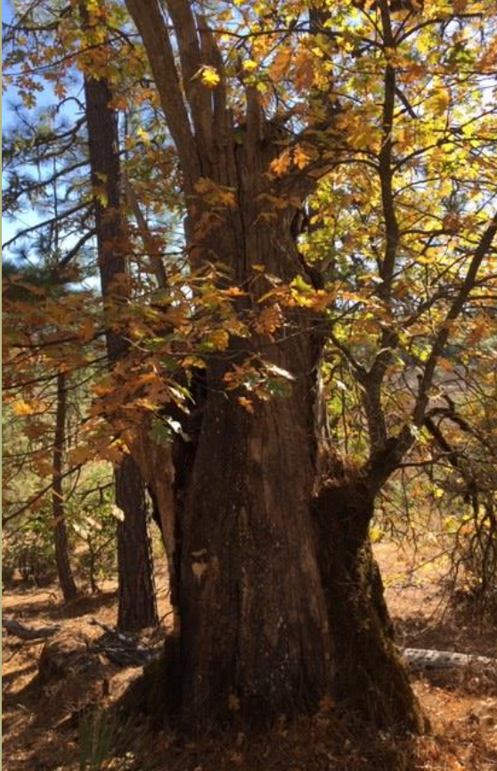
Even though the main part of this Black Oak fell many years ago, it still stands creating habitat and nesting areas.