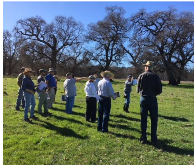
A group of Land Trust board members, biologists from the State Department of Fish and Wildlife and involved citizens visited the Wright property in the Spring of 2018.