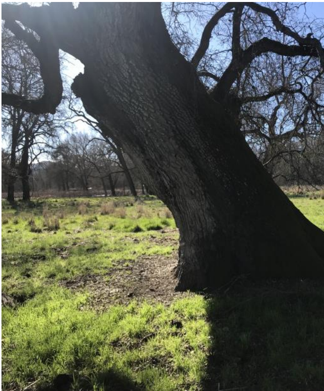
Many creatures find homes and food in oak trees.