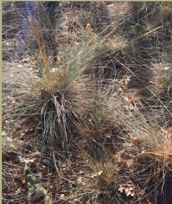
Native California Fescue grasses are abundant at Boggs Lake.