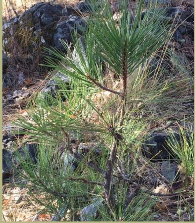
Ponderosa Pine are prevalent at Boggs. This small seedling has taken hold.