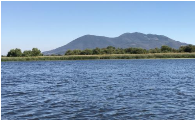
A good example of the beautiful intact shoreline along the Wright property near Lakeport.

The next step is to develop a management plan for this parcel and determine the highest and best use of this land that will both protect the important wildlife while allowing visitors to enjoy its glorious attributes.