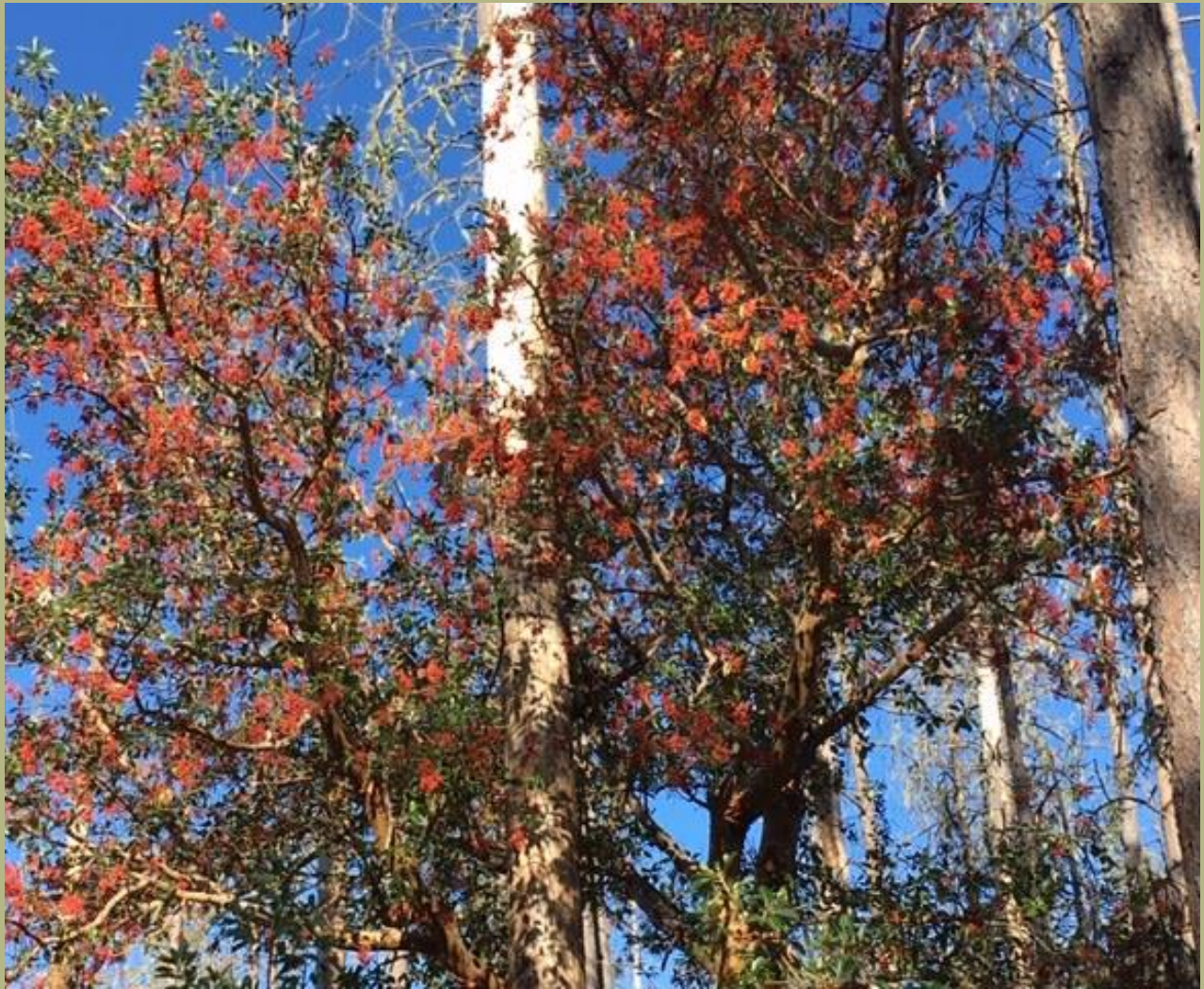
Madrone trees are part of the ecology at the Boggs Lake Preserve and this Fall had a tremendous supply of berries.