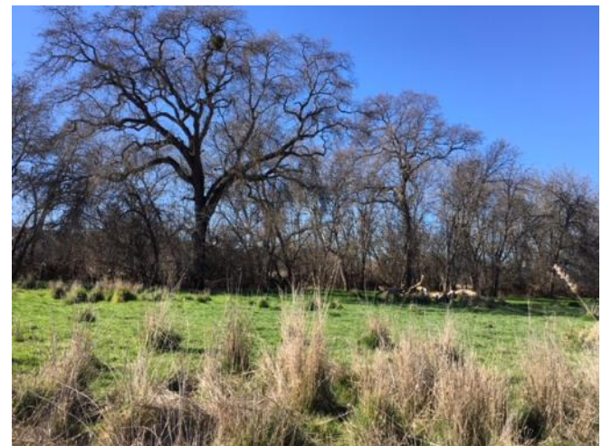
The property also features large Valley and Blue Oaks.