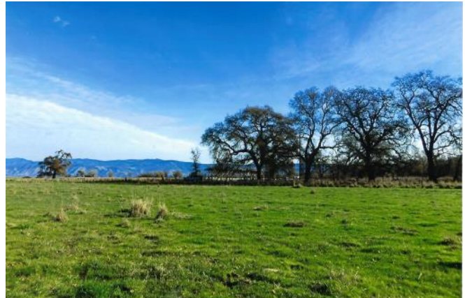
The upland pasture and oak habitat is also valuable.