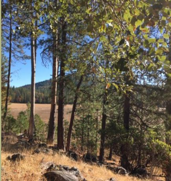
The Boggs Lake Preserve is jointly managed by the Lake County Land Trust and The Nature Conservancy.