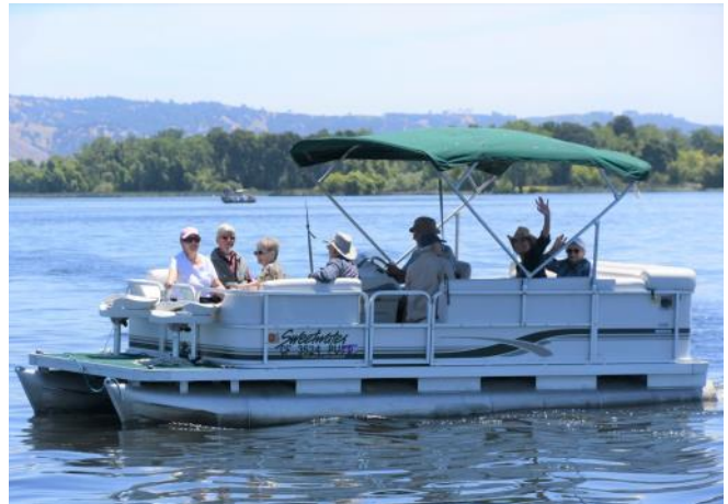
In Spring of 2019 a group of Big Valley Wetland project donors were treated to pontoon boat tours of the Lake County Land Trust's shoreline properties.