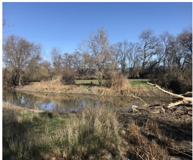
The Wright property has a variety of riparian areas from shoreline to this small inland canal.