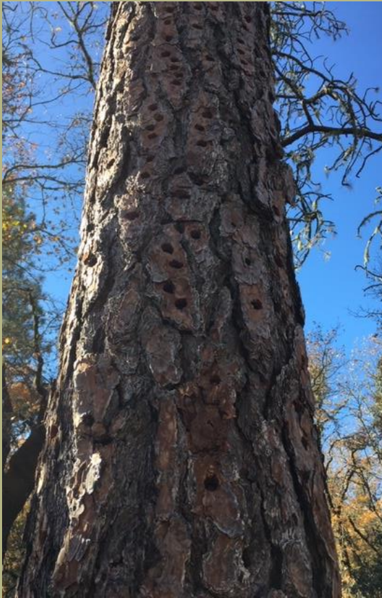
Acorn Woodpeckers use dead and dying trees as granaries, or “Cache Trees,” to store acorns for hard times.