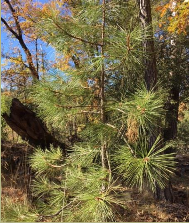
This Ponderosa Pine is doing well.