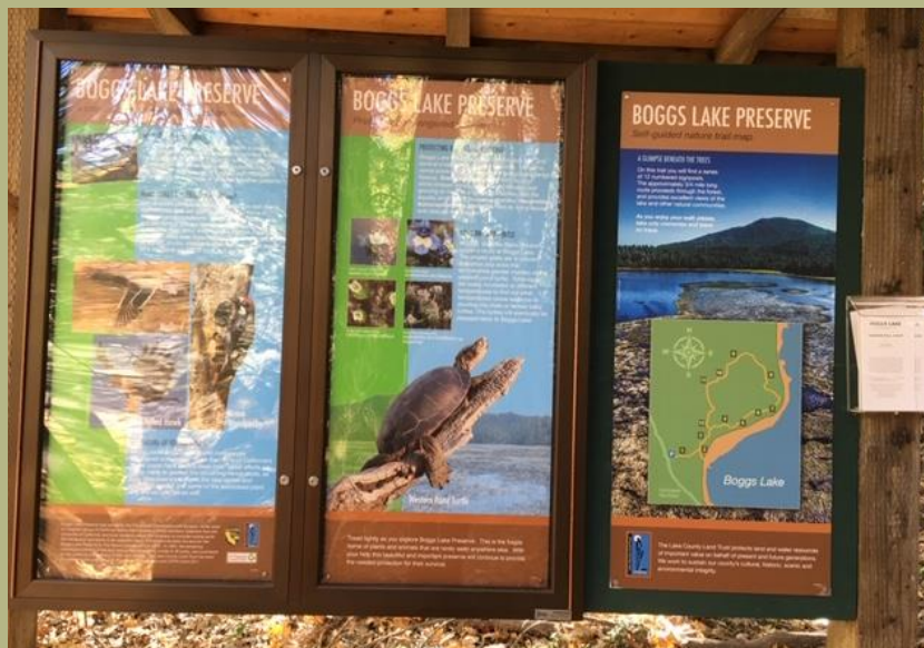
The kiosk was primarily paid for with grant funds from the Cobb Geothermal Mitigation Fund.